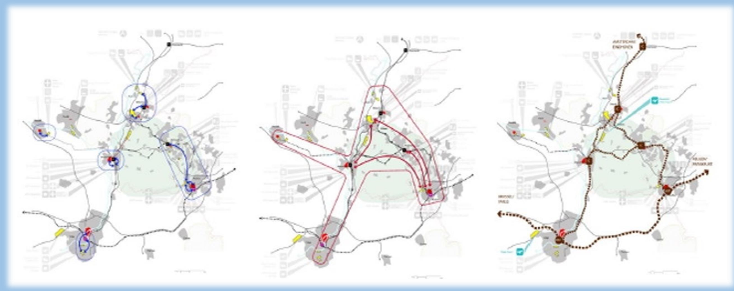
Railway stations and Campuses